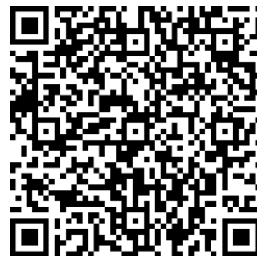
Food Safe Registration Form